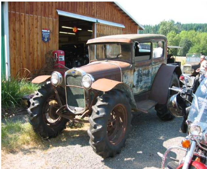
Busek's Auto Museum, Rough Rider

So, Boys and Girls if you choose to more fully emulate our western heroes, who we have been compared to, beware! A camp meal consisting of beans, hardtack, and coffee may seem innocent enough, but please be mighty careful when you reach for that canteen, and take a swig of water. If disaster were to strike any one of you, you'd surely be missed the rest of us!