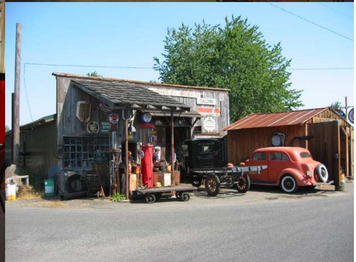
Clock wise from top left: A couple of good friends at the 08 Swap Meet; Inside Busek's Auto Museum; Busek's Auto Museum Gas Station; the Back Roads crew testing the temperature of the brew.