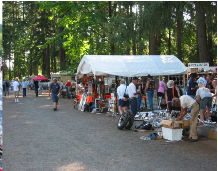
2008 Swap Meet