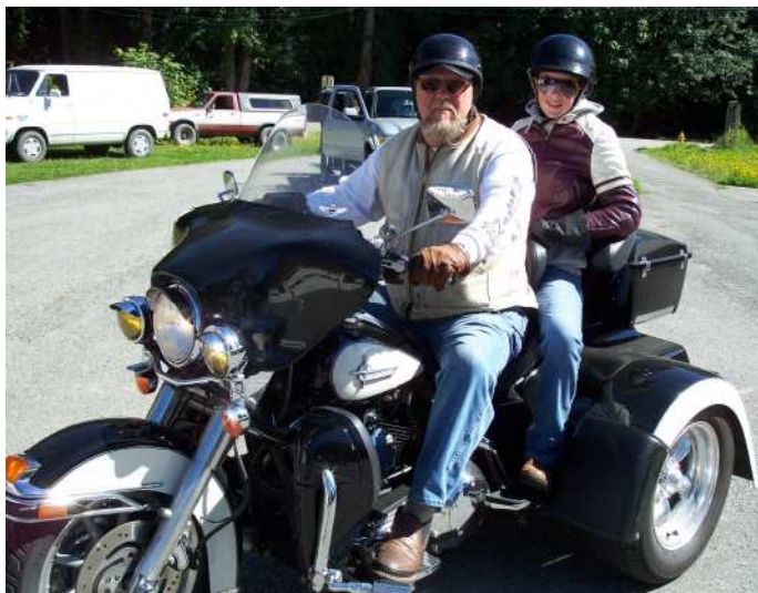
See Patti Palmer's "Lice can be Nice" story on page 6

Chapter web site link: www.evergreenamca.org